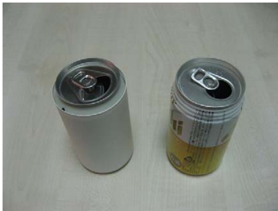
Aluminum products can developed by means of “deep drawing”

I have never been unsuccessful in work related to my specialty, “deep drawing”(i.e., a metal working process in which thin sheet metal is formed into a seamless cylinder such as a ballpoint pen, a lipstick holder or an aluminum can). A pull-tab aluminum can with a larger opening (like the can on the left in the photo) was invented by me. I can give you some tips. No matter how much I seem to be repeating a never-ending cycle of failures, I never give up, at any cost, until I achieve success. Just because I never gave up, nothing was ever impossible when my work involved deep drawing.