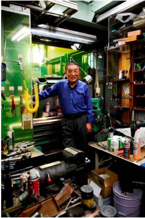
At his workshop crammed with long-used machines and tools

It is very obvious that industrious individuals can achieve accomplishments beyond God's miracles. Therefore, I believe that people should pursue professions that they enjoy.. In other words, if you choose a profession that you do not enjoy, you will perform your work half-heartedly and go nowhere.