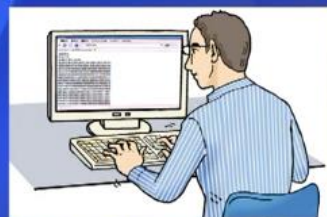
computer programs, etc.