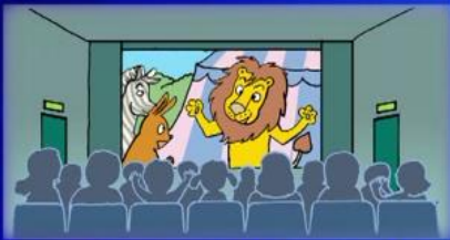
cinematographic works, animations,