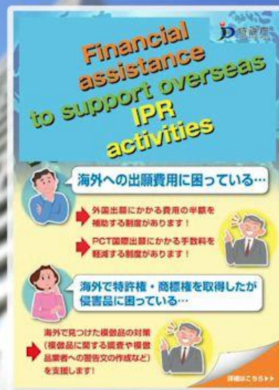
JPO pamphlet on financial support for anti-counterfeiting measures aimed at small and medium-sized enterprises