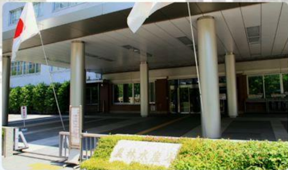
Ministry of Agriculture, Forestry and Fisheries

Supports Japanese enterprises expansion abroad Conveys requests to countries of destination