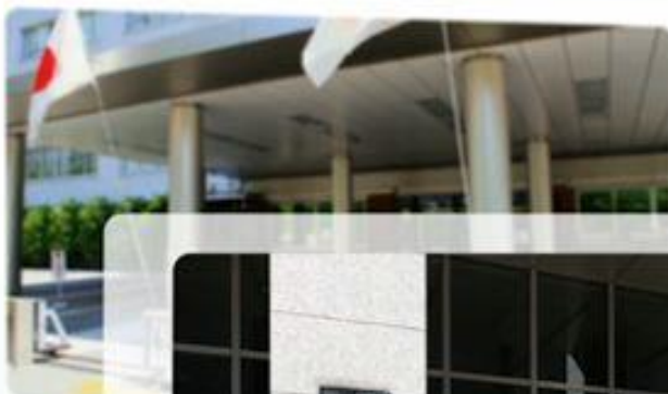
Ministry of Agriculture, Forestry and Fisheries

Deals with Internet copyright violations Sets up consulting service in Consumer Affairs Agency to control the spread of rights damage