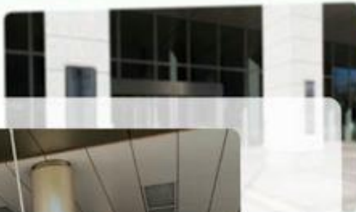
Ministry of Internal Affairs and Communications / Agency for Cultural Affairs

Monitors trademark applications as a measure to prevent counterfeits abroad masquerading as Japanese origin food products or agricultural, forestry or fishery products