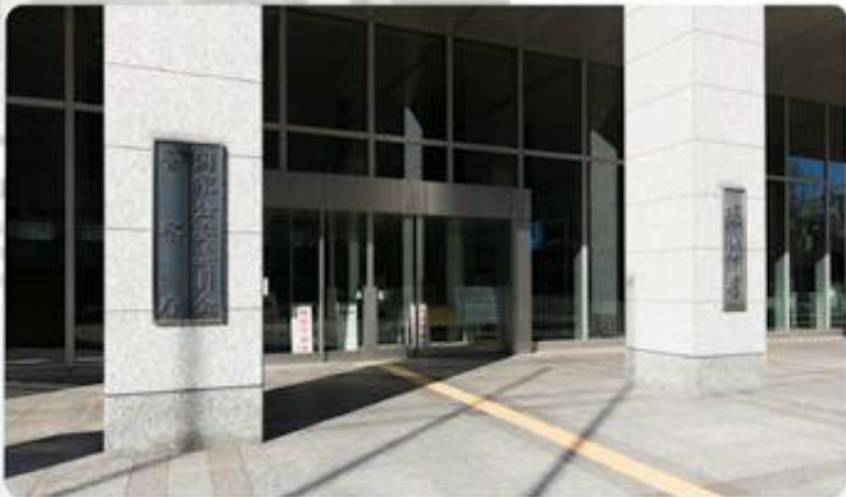
Ministry of Internal Affairs and Communications / Agency for Cultural Affairs

Monitors trademark applications as a measure to prevent counterfeits abroad masquerading as Japanese origin food products or agricultural, forestry or fishery products