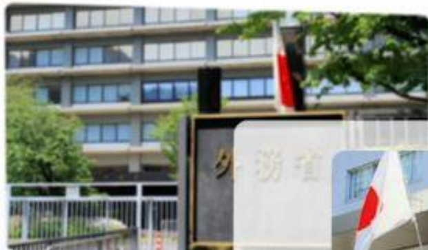
Ministry of Foreign Affairs

Supports Japanese enterprises expansion abroad Conveys requests to countries of destination