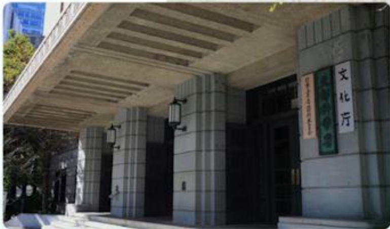
Agency for Cultural Affairs

Deal with Internet copyright violations Set up consulting service in Consumer Affairs Agency to control the spread of rights damage