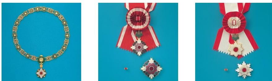
Supreme Orders of Chrysanthemum, Grand Cordon of the Order of the Paulownia Flowers, Orders of the Rising Sun