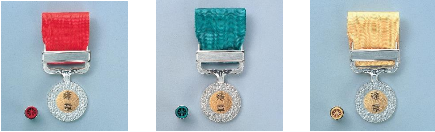
Medal with Red Ribbon, Medal with Green Ribbon, Medal with Yellow Ribbon