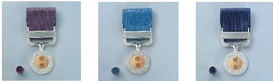
Medal with Purple Ribbon, Medal with Blue Ribbon, Medal with Dark Blue Ribbon