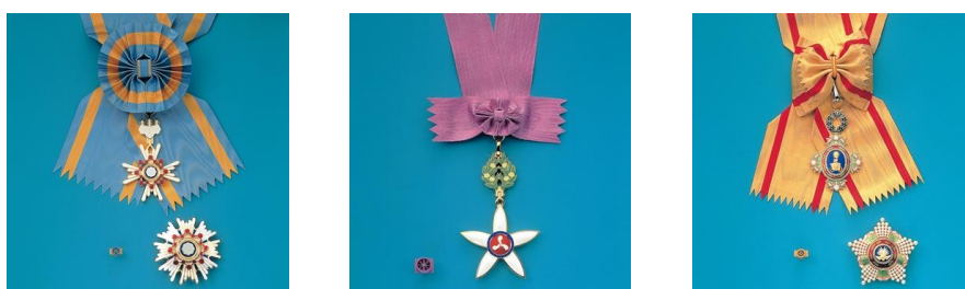
Orders of the Sacred Treasure, Order of Culture, Orders of the Precious Crown