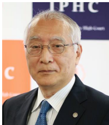
Name: SHIMIZU Hibiku Position: Presiding Judge, Intellectual Property High Court

In addition to the above, judged cases at Naha District Court, Otsu District/Family Court, Obihiro Branch of Kushiro District/Family Court, Judicial Research Official, Supreme Court (Civil) etc.