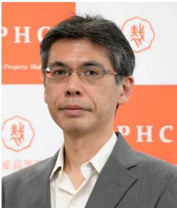
Name: MIZUNO Masanori Position: Judge, Intellectual Property High Court

Graduate of Faculty of Law, Tokyo University 1997 Appointed judge (Tokyo District Court) 2006 – 2008 Judge, Gifu District Court 2015 – 2016 Judge, Tokyo High Court 2020 – 2022 Presiding Judge, Nagoya District Court 2023~ Judge, Intellectual Property High Court In addition to the above, worked at Civil Affairs Bureau of Supreme Court.