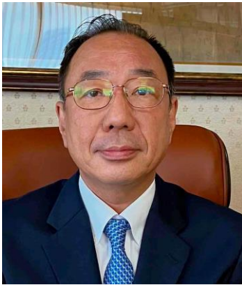
Name: KAWAHARA Ryuji Position: Vice-Minister of Justice of Japan