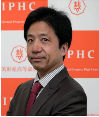
Name: IWAI Naoyuki Position: Judge, Intellectual Property High Court

Graduate of Faculty of Law, Tokyo University 1997 Appointed judge (Tokyo District Court) 2006 – 2008 Judge, Gifu District Court 2015 – 2016 Judge, Tokyo High Court 2020 – 2022 Presiding Judge, Nagoya District Court 2023~ Judge, Intellectual Property High Court In addition to the above, worked at Civil Affairs Bureau of Supreme Court.