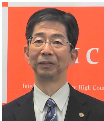
Name: HONDA Tomonari Position: Chief Judge, Intellectual Property High Court

2021 July 16, 2021 Justice of the Supreme Court