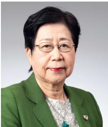
Name: FUCHIGAMI Reiko Position: President, Japan Federation of Bar Associations

While promoting the enhance the manpower and material resources of family courts, she also promotes gender equality and is working towards the realization of a selective separate surname system for married couples. She is also involved in the support of survivors and reconstruction efforts in disaster-stricken areas, the adoption of IT in civil trial procedures, and the reform of Japan's criminal justice system.