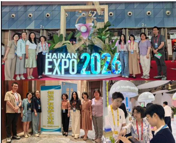
Consumer Products Expo (Haikou, Apr)