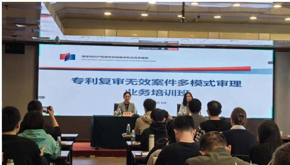
▲ Training for IP Protection Centers

Establishing oral hearing courts at IP protection centers to form a nationwide service network, ensuring professional and efficient hearing services for all regions.