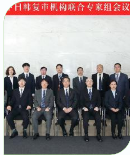
Joint Experts Group Meeting for Trial and Appeal (JEGTA) among CNIPA, JPO and KIPO