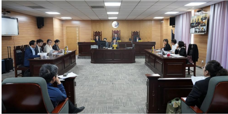
▲ Remote Hearings