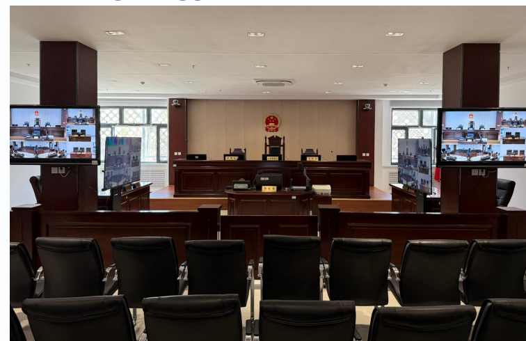
▲ Oral Hearing Court: 3,077 Kilometers Away