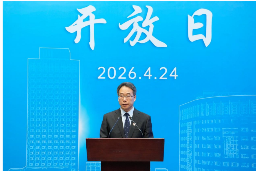
IP Open Day