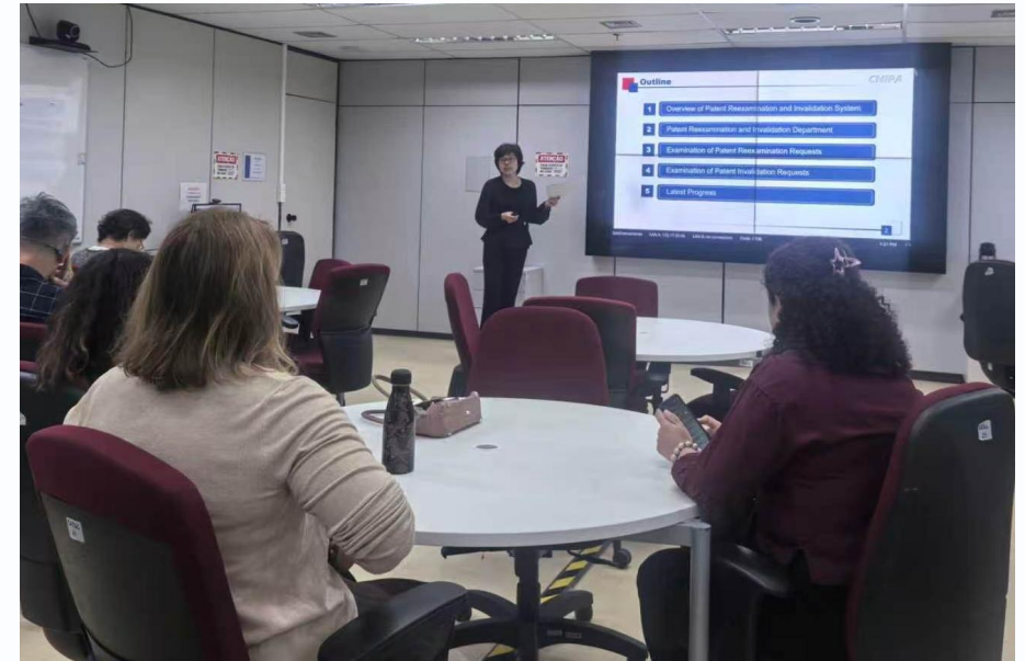
Lectures for overseas IP practitioners