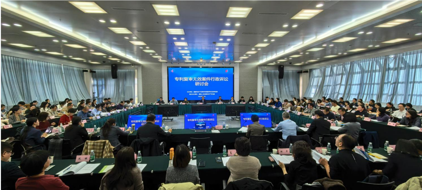
Seminar with Courts