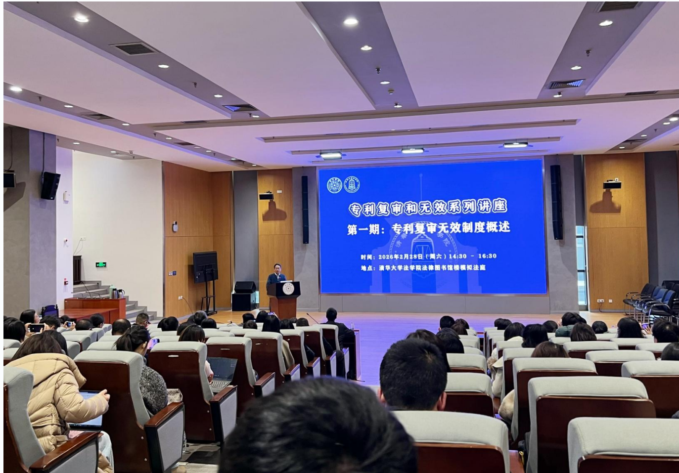
Cooperation with Academic Institutions and Universities