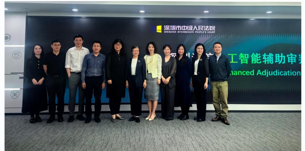
"Artificial Intelligence" Technology Research