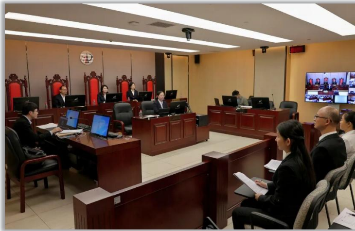
▲ Joint Trials of Infringement & Invalidation Cases