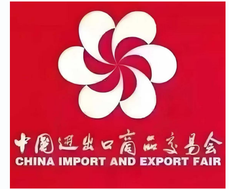
Canton Fair (Guangzhou, Apr & Sep)