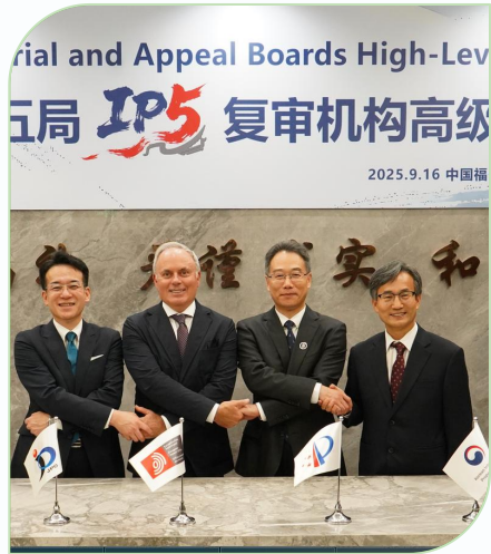
IP5 Boards High-level Meeting