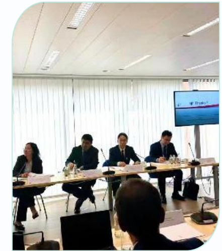
Meetings with EUIPO and DG TRADE