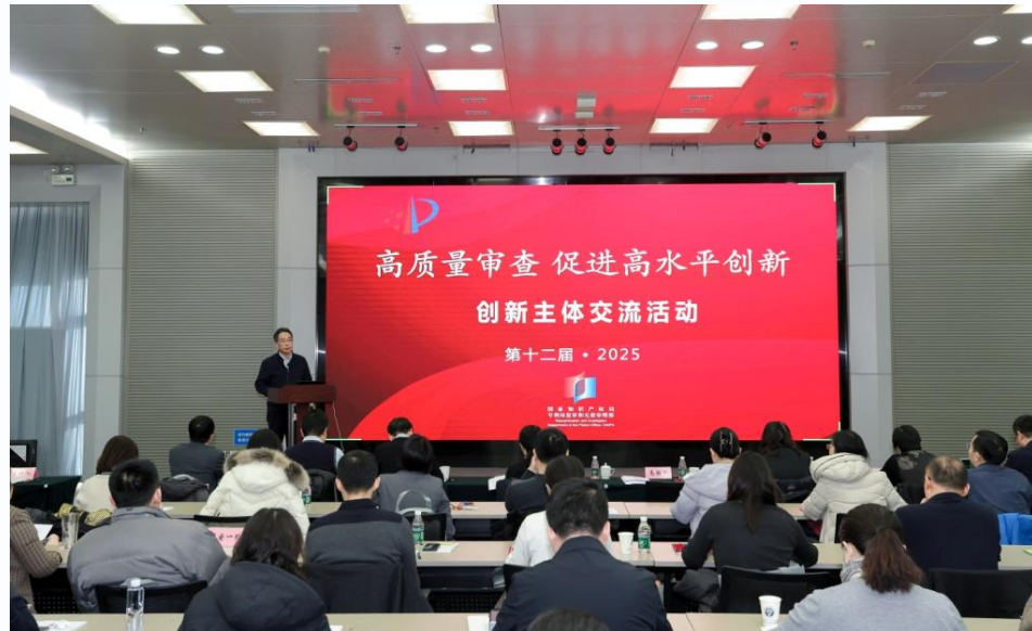
Exchange with Users