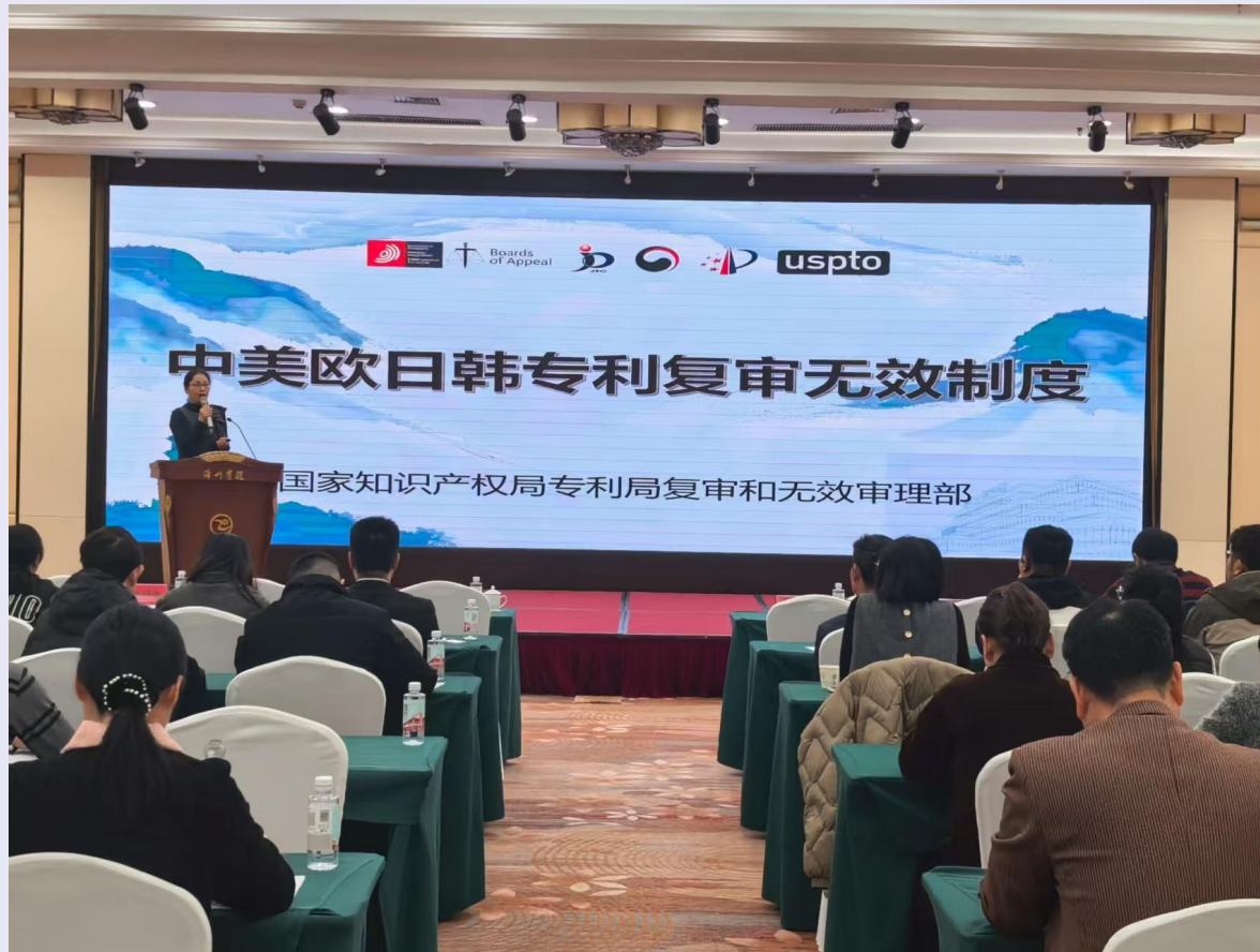
Lectures on IP5 Trial and Appeal Procedures