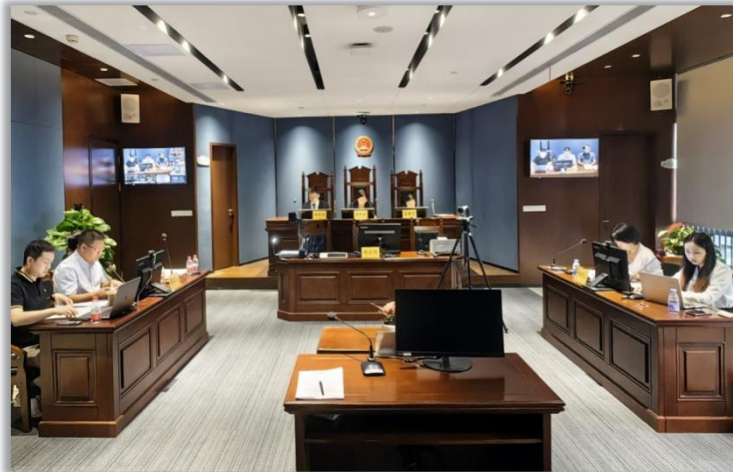
▲ Circuit Hearings