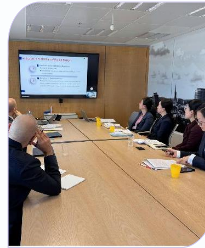
Exchange with EUIPO Boards of Appeal