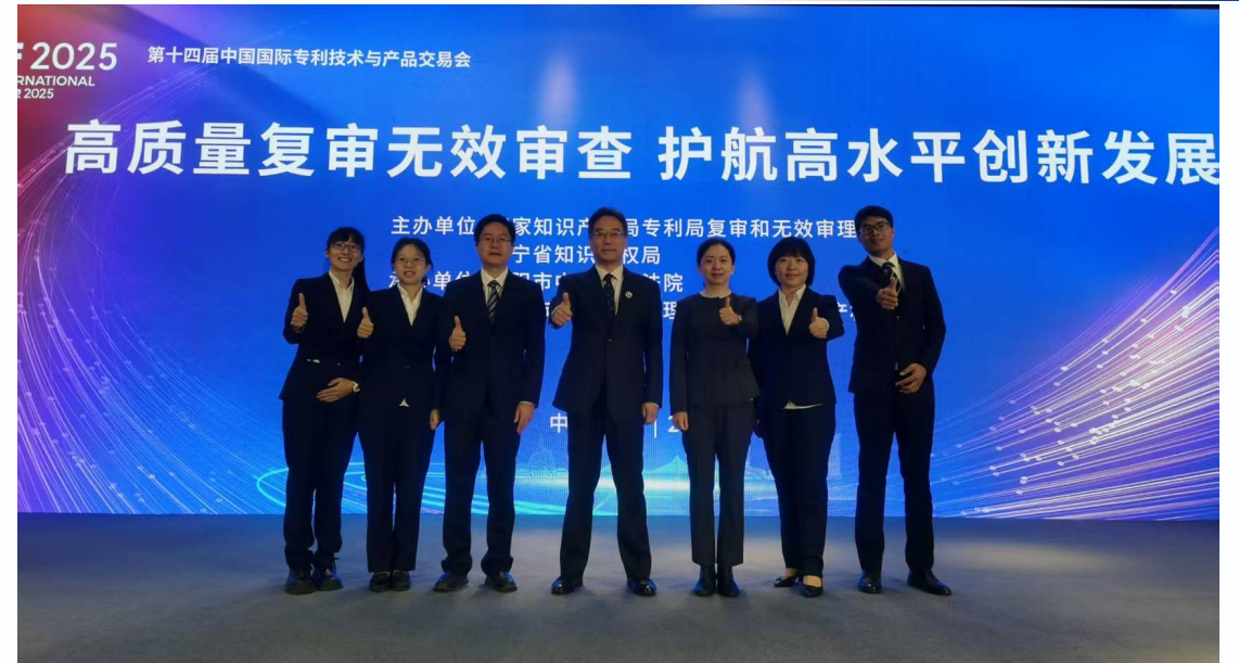
China International Patent Fair 2025