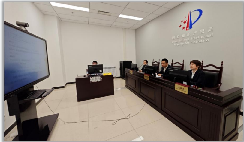
▲ Remote Hearings