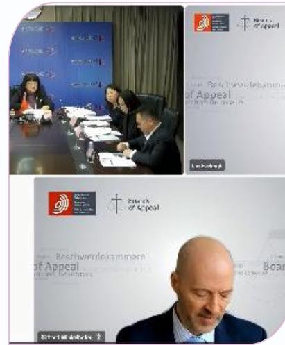
Online Exchange with EPO Boards of Appeal