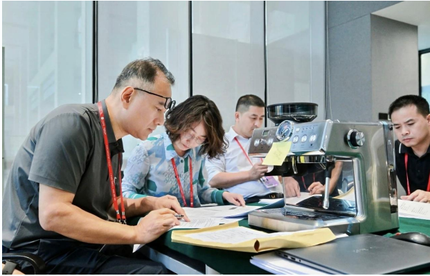
Supply Chain Expo (Beijing, July)